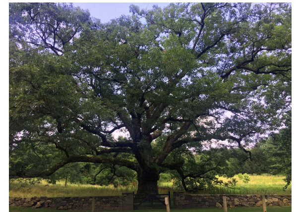
The Bedford Oak